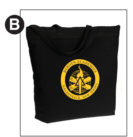
BCA Zipper Tote Bag