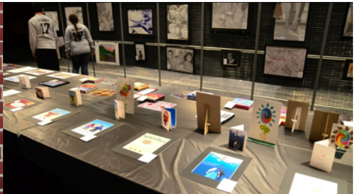
Getting Ready for Bat Boy From Print Week Exhibit-January 15-16

But wait! There's more! Tuesday, March 11th is the Winter Music Concert , featuring all seven of BCA's instrumental ensembles. From unique arrangements for small ensembles to large-scale orchestra works, the students present a top quality performance! Your $5 donation at the door supports music at BCA.